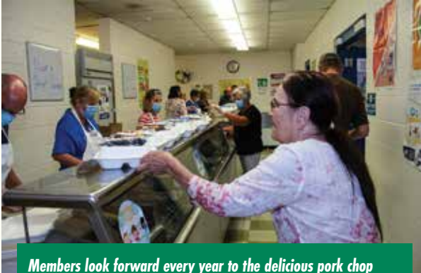
Members look forward every year to the delicious pork chop dinner prepared by the Mason County Pork Producers.