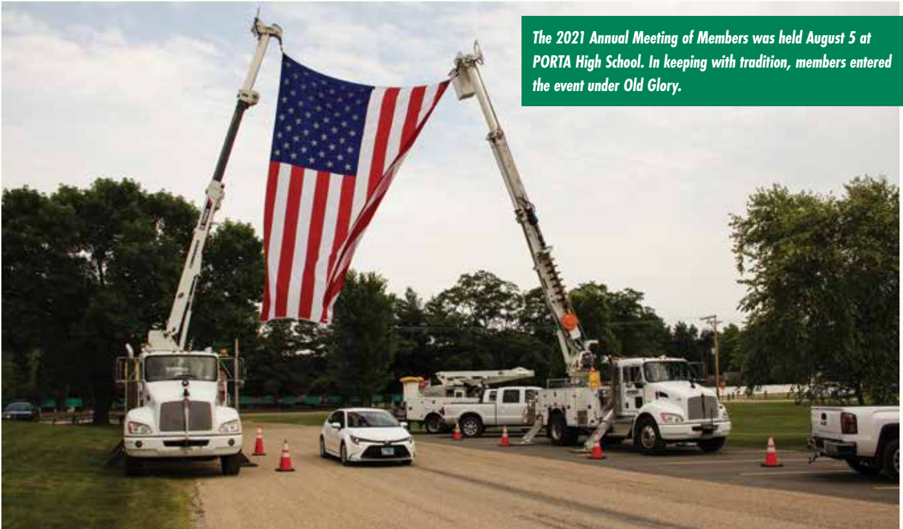
The 2021 Annual Meeting of Members was held August 5 at PORTA High School. In keeping with tradition, members entered the event under Old Glory.